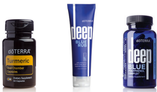
Turmeric Capsules / Deep Blue Rub Deep Blue Polyphenol Capsules