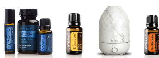
Adapativ™ Collection / Elevation Volo Diffuser / Frankincense