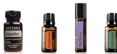
Copaiba Capsules / Frankincense / Digestzen Past Tense / Eucalyptus