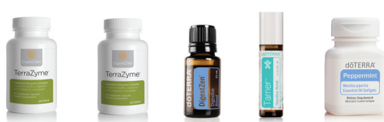
Terrazyme / PB Assist / Digestzen Tamer / Peppermint Softgels