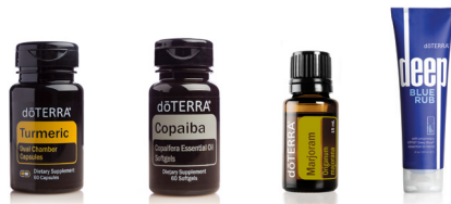
Turmeric Capsules / Copaiba Capsules Marjoram / Deep Blue Rub